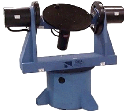
Model 1533 Three-Axis Rate and Positioning System

The 1532 and 1533 are two and three-axis test tables, respectively. These tables have wire wrap allowance for limited rotation applications. This provides an economical alternative to using slip rings. Wire wrap test tables are designed for high reliability, minimal electrical noise, and low maintenance. All of these test tables use high precision ball or cross roller mechanical bearings which are preloaded to minimize axis wobble and friction characteristics. Each test table has a hard, anodized aluminum table platform for mounting the units under test (UUT).