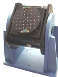
1291BR with Tilt Stand