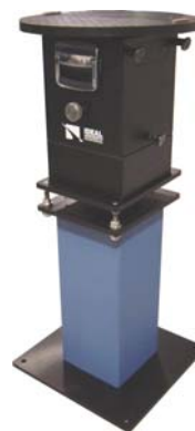
1291BR with Pedestal