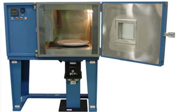
1291TC with 18 inch table top and vertical axis configuration

The 1291BR rate table can be positioned underneath (vertical axis configuration) or to the side (horizontal axis configuration) of the temperature chamber. A shaft extension passes through a seal in the floor of the thermal chamber, the table is mechanically separated from the thermal chamber in order to reduce vibration transfer. The table shaft extension is insulated, heated, and cooled, to protect the table from the temperature extremes in the chamber, and from condensation damage.