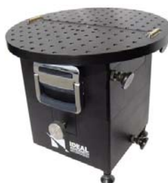
1291BR in vertical axis configuration