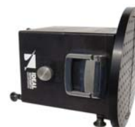
1291BR in horizontal axis configuration