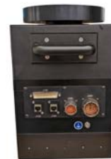
1291BLX in vertical axis configuration