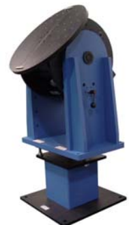
1291BLX with tilt stand mounted on a pedestal