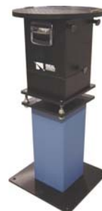
1291BLX with pedestal