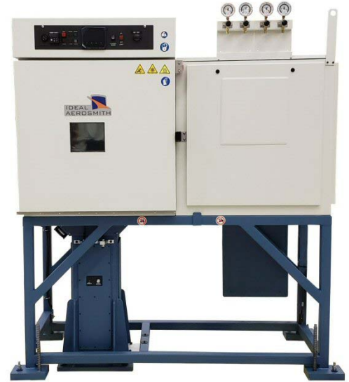
1291BLX temperature chamber with 18 inch tabletop in vertical axis configuration

Made with a steel exterior and a stainless steel interior, the 1291BLX thermal chamber comes with an integral microprocessor temperature controller, controllable via RS-232 and Ethernet interface. A stand-alone PC application program and drivers for use in test application programs are available with the system.